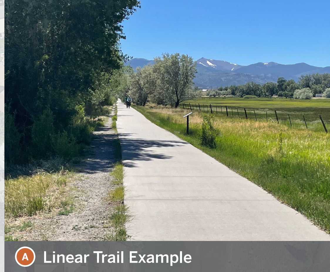
A Linear Trail Example