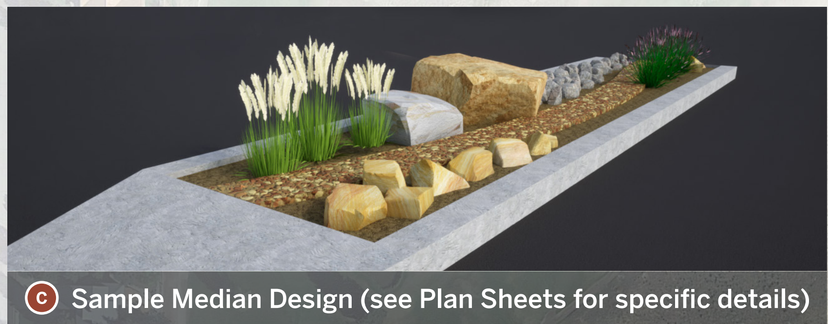
C Sample Median Design (see Plan Sheets for specific details)