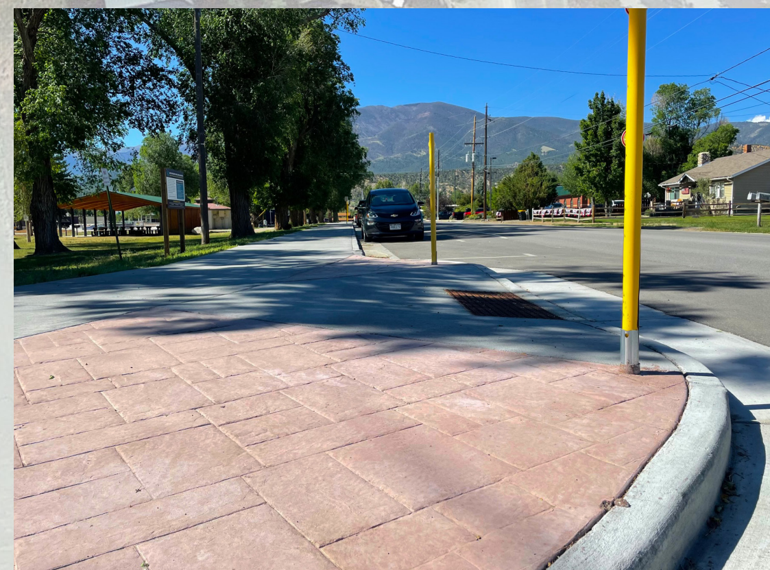
D Colored/Stamped Concrete Example