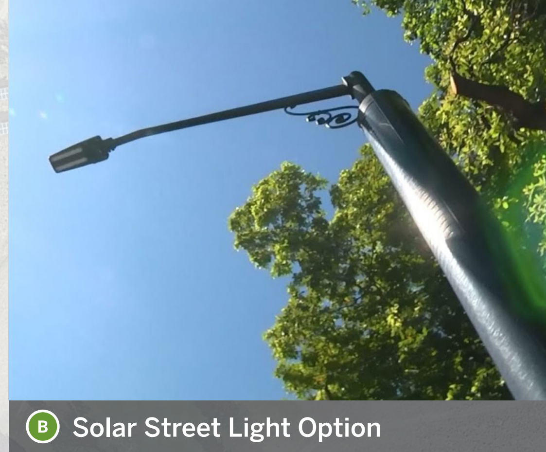
B Solar Street Light Option