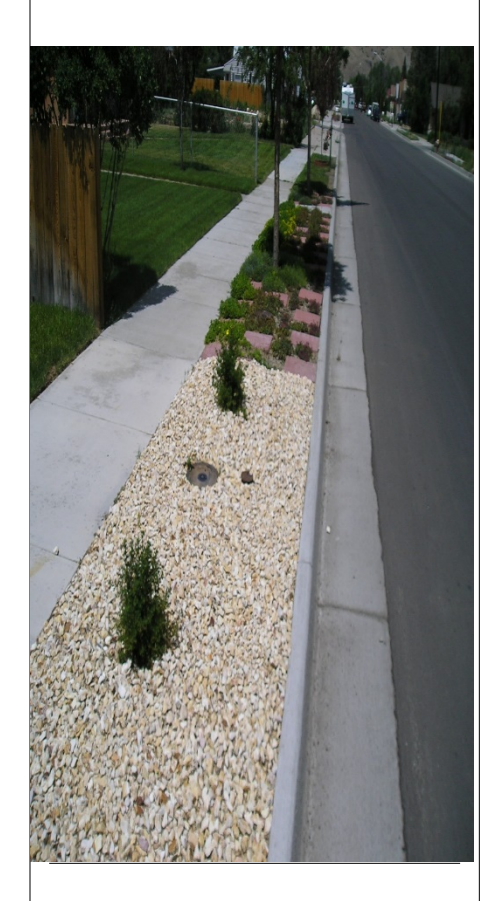
City of Salida - Public Works